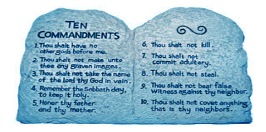
Exodus 19:16-18 & Chapter 20: Ten Commandments.

Then the Giving of the Law / Now the Giving of the Spirit